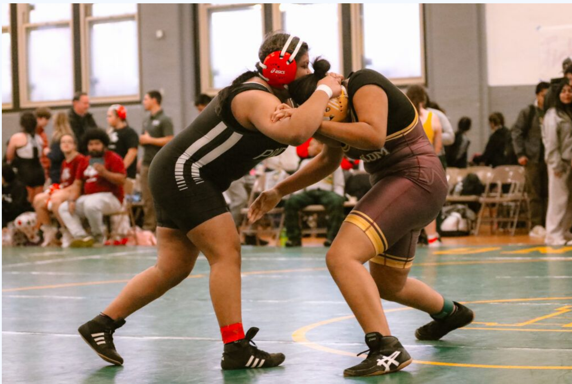
CPL wrestlers at Lady of Lane Girls Wrestling Tournament, 2025 Full gallery here .