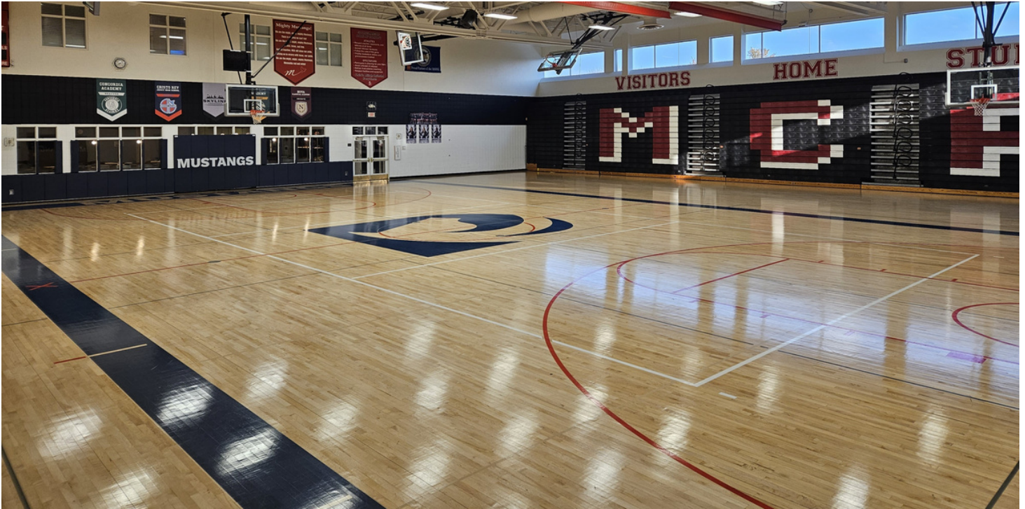
The Stable is home to Mustang Basketball and Volleyball.