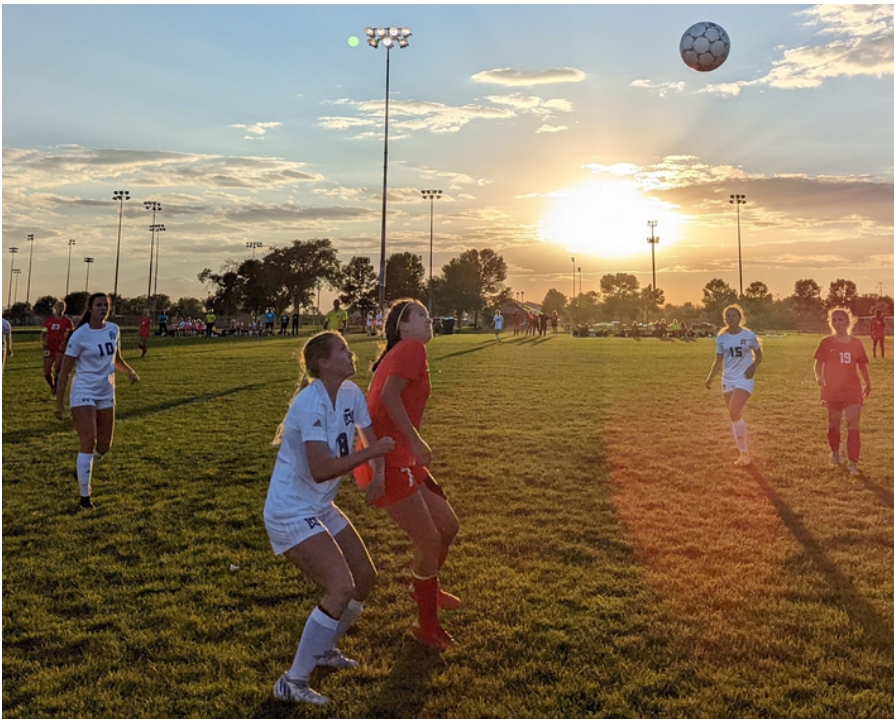
Noble Sports Park is home to Mustang Soccer.