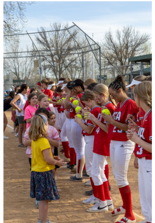
Zane Sports Park is home to Mustang Softball.