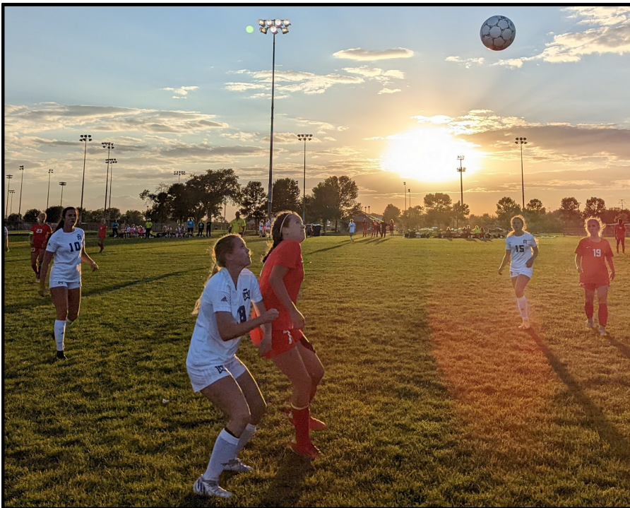
Noble Sports Park is home to Mustang Soccer.