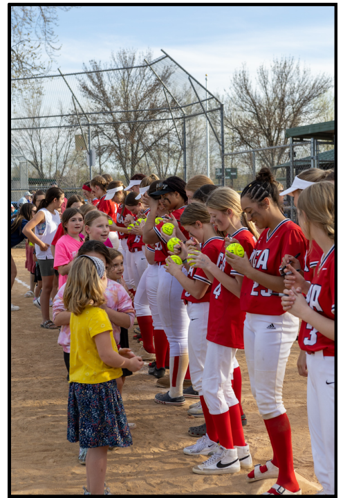
Zane Sports Park is home to Mustang Softball.