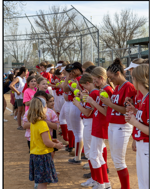
Zane Sports Park is home to Mustang Softball.