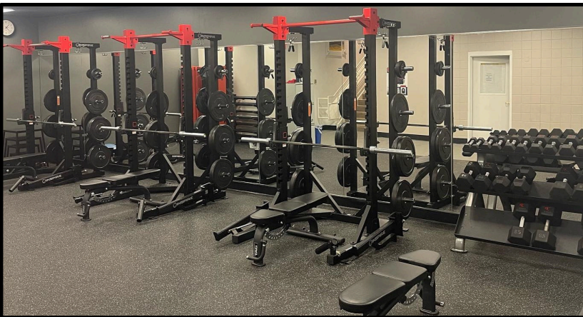
Mustang Athletics Weight Room.