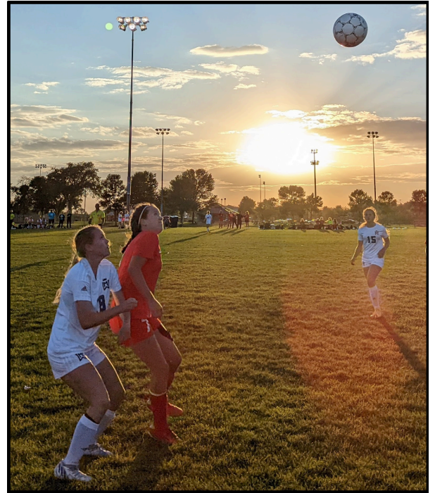
Noble Sports Park is home to Mustang Soccer.