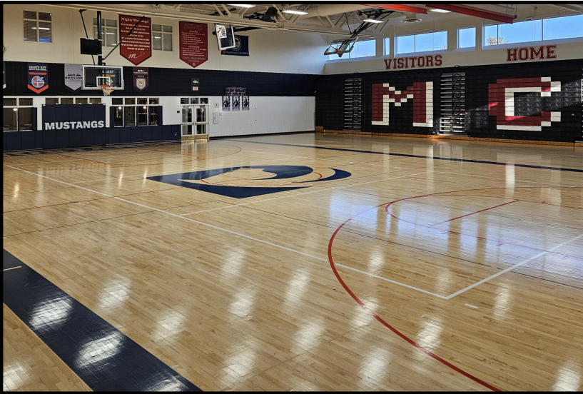
The Stable is home to Mustang Basketball and Volleyball.