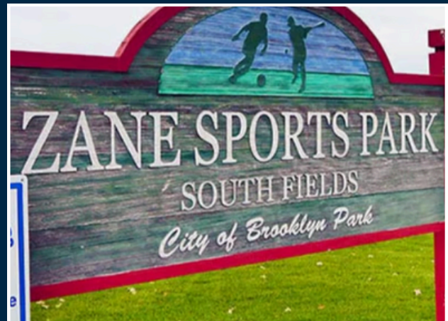
Zane Sports Park is home to Softball.