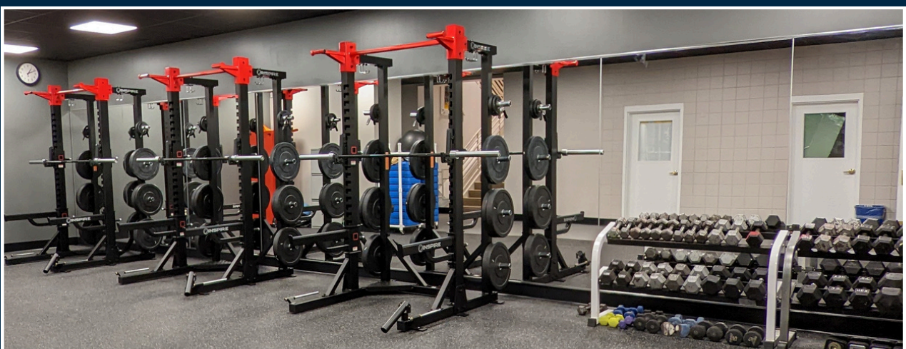
Mustang Weight Room at Maranatha Christian Academy.