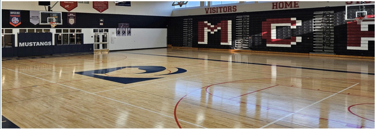
The Stable at Maranatha Christian Academy is home to Basketball and Volleyball