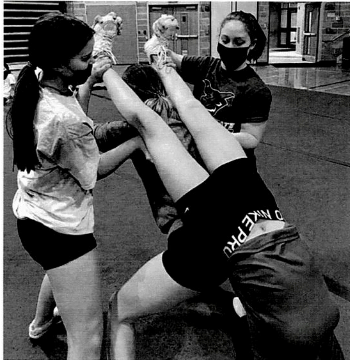
Ex 3: A side base whose hands are on the upper body/back of the flyer OR a side base's foot is behind the person basing the inversion.