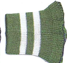
Knit Pattern #4