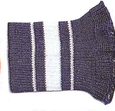
Knit Pattern #5