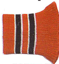
Knit Pattern #2