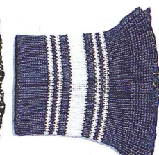
Knit Pattern #1