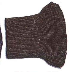
Knit Pattern Solid