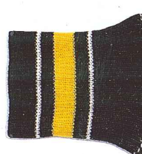
Knit Pattern #53