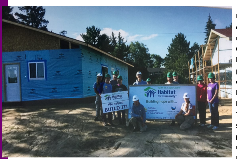
Volunteers in West Eveleth, Women's Build Day, Aug. 24, 2019

*Reminder: The 2020 Habitat will be granted some time in January— Must apply by December 10th