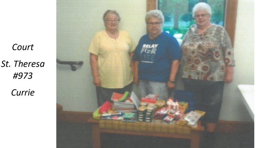
Above: Currie Court held a campaign to collect school supplies. The area schools sent a 'thank you', saying that they were badly needed!

Above: Currie Court plays BINGO at local nursing homes and serves cake & sherbet at these events.