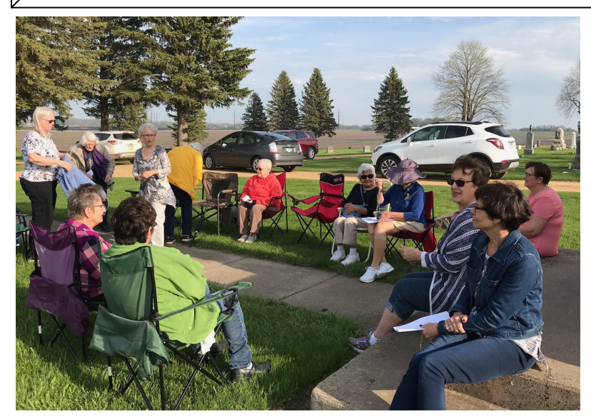
Court St. John #1371, Pipestone, met at the St. Leo Catholic Church cemetery prior to our May 16th, 2019 meeting to pray the Rosary. Members brought their chairs and rosaries. The evening was delightful!

will be held in Dallas, Texas. The dates are July 15-19, 2020. For reservations call Central Reservations for Marriot, at 888-627-8191. There are 600 rooms reserved, so please do not overbook. The Call to Convention will be coming out in December with the other info about the Convention.