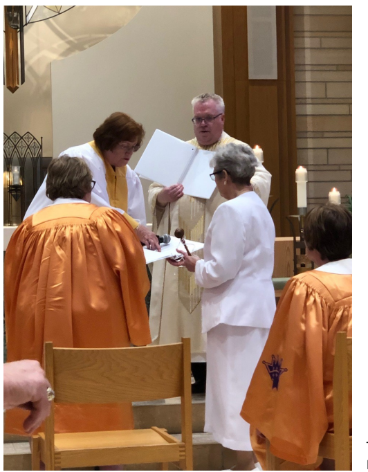
The passing of the gavel and signing of the document