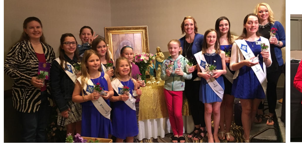
Minnesota JCDA members