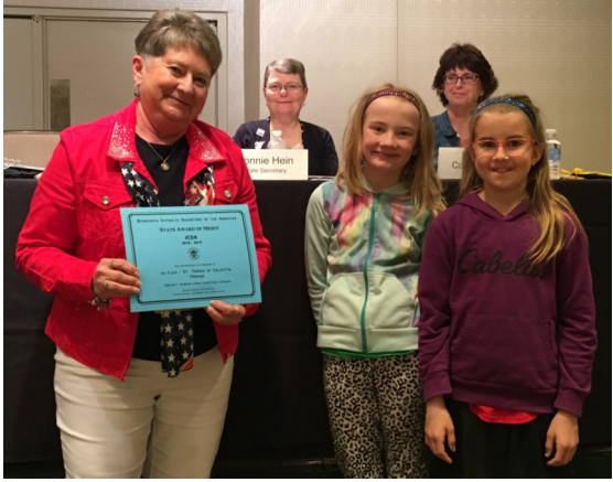
JCDA Merit Award