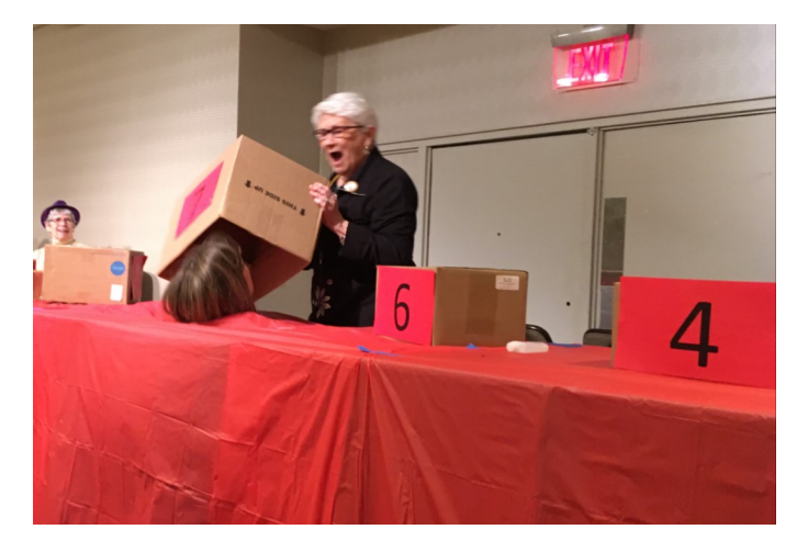
What's in the Box!!