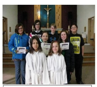
Pictured: Education contest winners

Members of Court St. Justin #2020 Mahnomen, MN participated in the CDA Education contest. Certificates were presented during an All School Mass at St. Michael's.