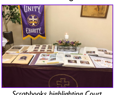
Scrapbooks highlighting Court Madonna's 95 year history