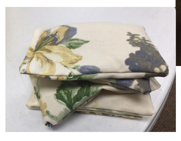
JCDA Court St. Teresa of Calcutta, Perham

Idea from St. Charles JCDA—We have a "hostess" for each meeting and that person or group of girls are in charge of a faith based lesson for that meeting. This is a good idea for either JCDA or CDA courts!