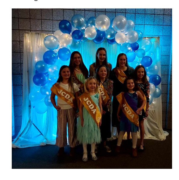
Thanks to our four JCDA courts—they are our FUTURE ! Let's promote and establish more JCDA courts in Minnesota!