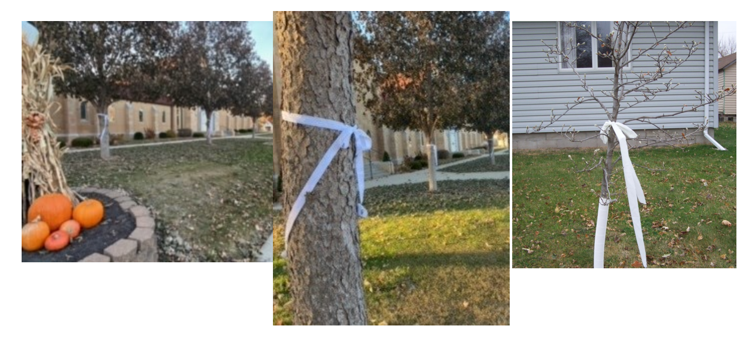
Below: There were two new projects for Court St. Mary #509, Moorhead this fall: one for Education and one for Legislation.

The Catholic Daughters of Blue Earth Court Joan of Arc #691 displayed white ribbons in front of our church on the trees and asked CDA members to display ribbons at their homes and on various places in town as a reminder that involvement with pornography leads to behavioral, psychological and social problems and for the need to enforce obscenity and related laws.