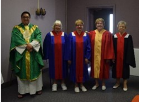
Officers of Court St. Anne #1840