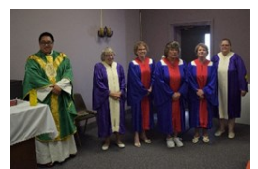
Officers of Court Owatonna #1180

In 2024 it will be Court Owatonna's turn to host the Joint Installation of Officers and New Member Reception.