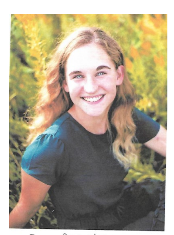
CDA Scholarship Committee