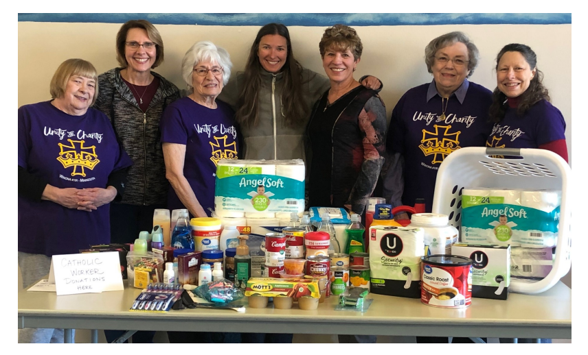
Above: Court Winona #191 gathers donations for the Catholic Worker house in Winona at the February 2022 meeting.

Left: Donations included food, personal care items, towels, blankets, socks, t-shirts, and more (shown in attached picture).