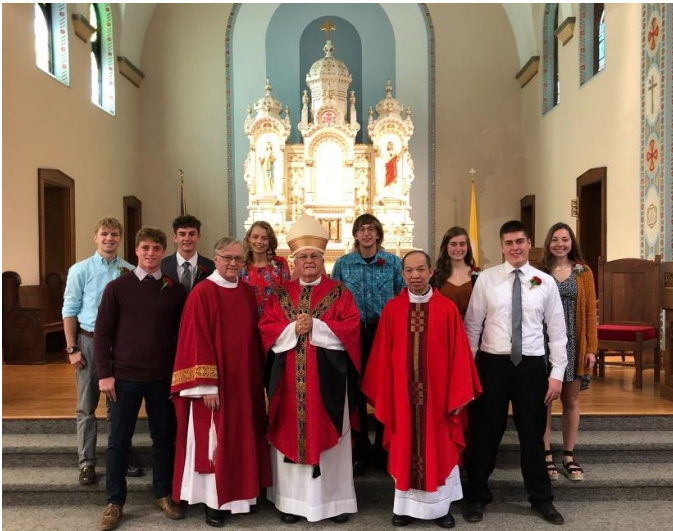
Left: Court Queen of Peace #1558, Slayton, in support of the Confirmation students from St. Ann's Parish, remembered the students with key chains.