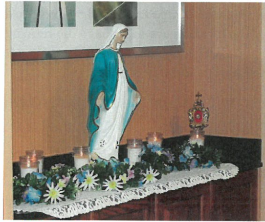
The 49th Biennial Minnesota Catholic Daughters of the Americas convention was held at the Courtyard by Marriott in Moorhead. Although it was mostly a 'Virtual Convention', the State Board, the National Representative, and some other 'special' members were present in live form. Above: The shrine was a beautiful tribute to our Blessed Mother and adorned the meeting room.

A Memorial Mass was held on Friday, April 23rd, at St. Joseph's Catholic Church to honor our deceased members who passed away since the last convention. This mass was live streamed for all CDA members. Packets of Forget-Me-Nots were handed out for each deceased member to be passed on to their families.