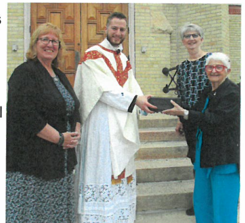
It was a wonderful trip for all.