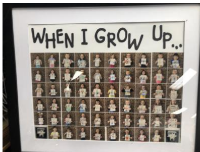
Photo Collage showing what the kids want to be when they grow up.