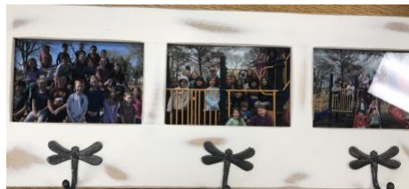
Framed picture of all 3 classes