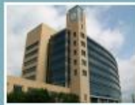
Building Enclosure Commissioning

as you celebrate 40 years of serving the K-12 Educational Facilities in the State of Minnesota and for allowing Inspec the opportunity to work with over 260 school districts.