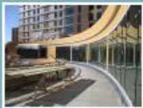
Exterior Walls and Windows