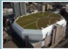
Vegetated Green Roofs