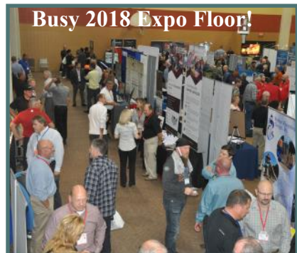
Busy 2018 Expo Floor!