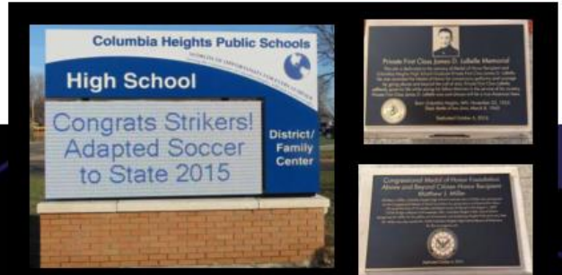
Columbia Heights Monument signs & Dedication Plaques 2016