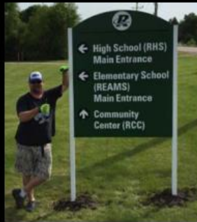
Rockford Wayfinding 2016