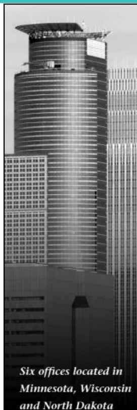
Six offices located in Minnesota, Wisconsin and North Dakota

As the year draws to a close, take some time to reflect on the resolutions you made in January. How did you do? Did you work hard? Did you make the deadlines or do you need another year? Give yourself some grace. You've laid the ground work to achieving your dreams, and you can take the next year to perfect them. Learn from the previous year's mistakes and grow. Every year is another chance to get it right.