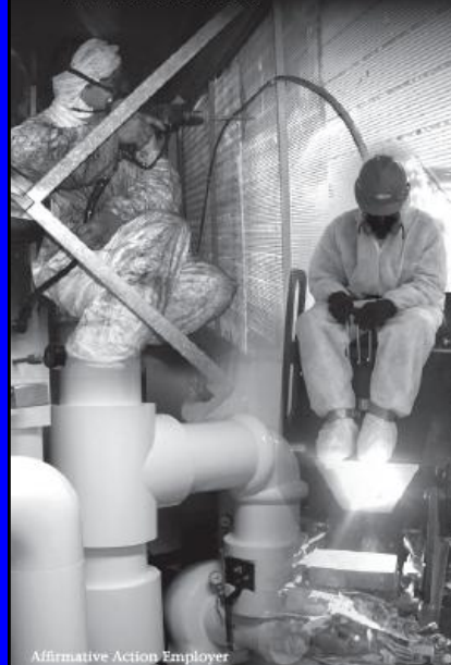
Affirmative Action Employer