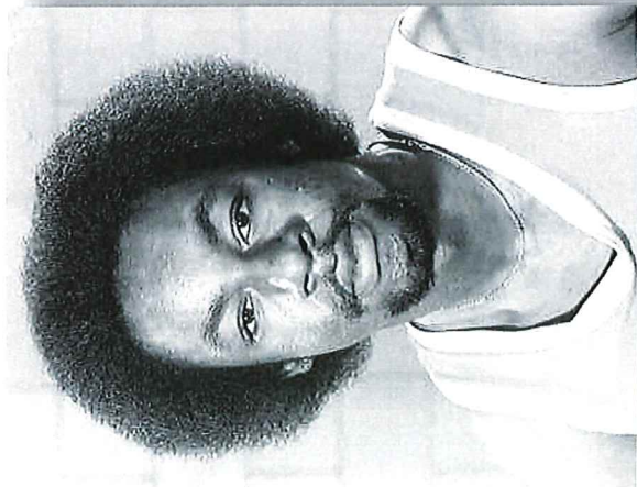
IUPUI University Library Ruth Lilly Special Collections and Archives