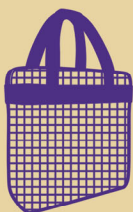
PATTERN PLASTIC BAG