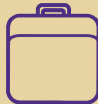
SEAT CUSHION WITH A POCKET