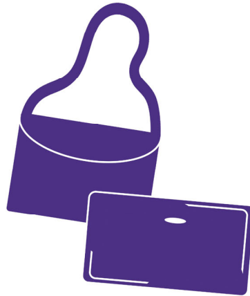
CLUTCH WITH SHOULDER OR WRIST STRAP