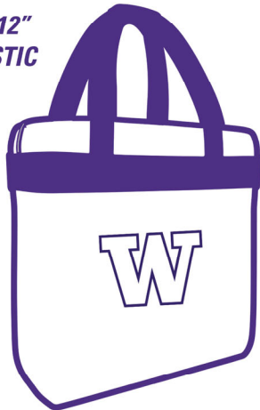
12" x 16" x 12" CLEAR PLASTIC BAG