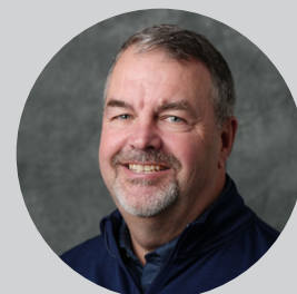
Executive Director WIAA

The Washington Officials Association (WOA) salutes all student-participants in this year's WIAA State Tournament, presented by Gesa Credit Union. It takes an incredible amount of effort and hard work to reach this point in the the season, and that dedication you've shown to get here is truly commendable. Congratulations to all of the student-participants for reaching this stage, and enjoy the moments and memories created from this special experience.