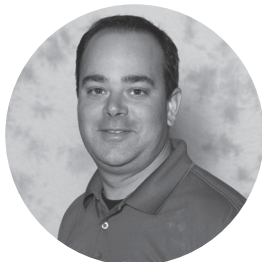
Executive Director WOA