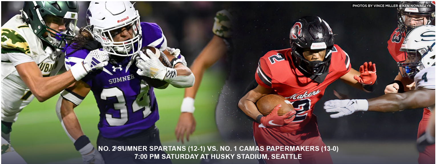
NO. 2 SUMNER SPARTANS (12-1) VS. NO. 1 CAMAS PAPERMAKERS (13-0) 7:00 PM SATURDAY AT HUSKY STADIUM, SEATTLE