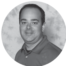
Executive Director WOA