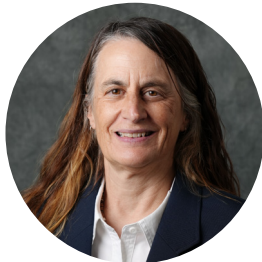
Athletic Director Seattle Academy

On behalf of the WIAA Executive Board, welcome to the WIAA State Championships, presented by Gesa Credit Union! We are here to celebrate our student-athletes, to applaud their hard work and perseverance, and acknowledge their success. Congratulations to the student-athletes! Thank you to the coaches, teachers, families and communities who surrounded athletes with the support necessary to help make their season-long journey successful.