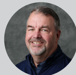
Executive Director WIAA

The Washington Officials Association (WOA) salutes all student-participants in this year's WIAA State Tournament, presented by Gesa Credit Union. It takes an incredible amount of effort and hard work to reach this point in the the season, and that dedication you've shown to get here is truly commendable. Congratulations to all of the student-participants for reaching this stage, and enjoy the moments and memories created from this special experience.