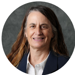
Athletic Director Seattle Academy

On behalf of the WIAA Executive Board, welcome to the WIAA State Championships, presented by Gesa Credit Union! We are here to celebrate our student-athletes, to applaud their hard work and perseverance, and acknowledge their success. Congratulations to the student-athletes! Thank you to the coaches, teachers, families and communities who surrounded athletes with the support necessary to help make their season-long journey successful.