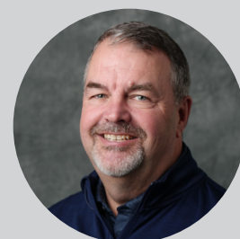
Executive Director WIAA

The Washington Officials Association (WOA) salutes all student-participants in this year's WIAA State Tournament, presented by Gesa Credit Union. It takes an incredible amount of effort and hard work to reach this point in the the season, and that dedication you've shown to get here is truly commendable. Congratulations to all of the student-participants for reaching this stage, and enjoy the moments and memories created from this special experience.