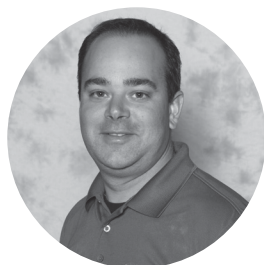
Executive Director WOA