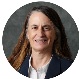
Athletic Director Seattle Academy

On behalf of the WIAA Executive Board, welcome to the WIAA State Championships, presented by Gesa Credit Union! We are here to celebrate our student-athletes, to applaud their hard work and perseverance, and acknowledge their success. Congratulations to the student-athletes! Thank you to the coaches, teachers, families and communities who surrounded athletes with the support necessary to help make their season-long journey successful.