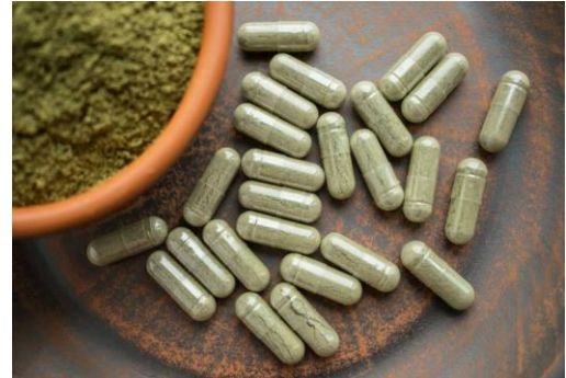
By Partnership Staff Dec. 2019 DrugFree.org

To read about McLeod County's program for safe disposal of unneeded medications, click here