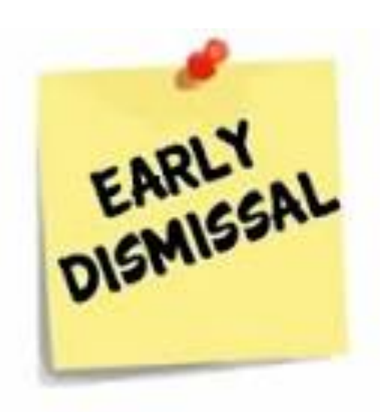
Kindergarten - 6<sup>th</sup> Grade 11:30 Dismissal Thursday, April 17<sup>th</sup> High School will have a full day of school