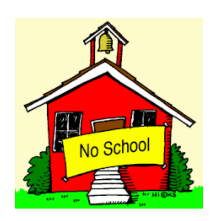
All Students Friday, April 18<sup>th</sup> and Monday, April 21<sup>st</sup> Spring Break