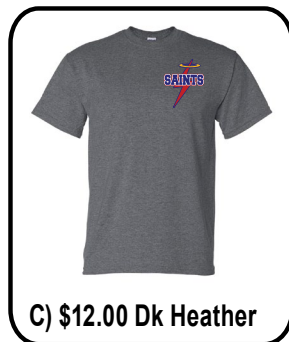
C) $12.00 Dk Heather