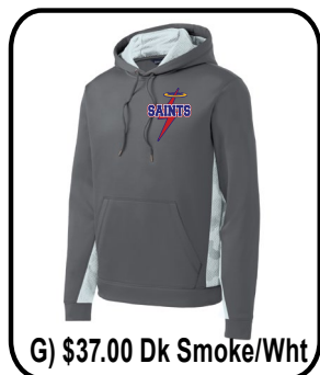
G) $37.00 Dk Smoke/Wht

Order/Money can be turned into KMS Elementary Office