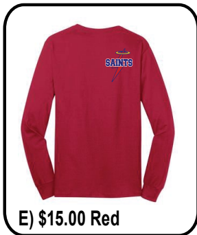
E) $15.00 Red