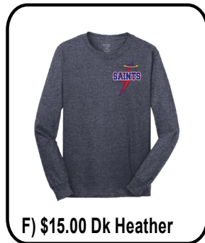
F) $15.00 Dk Heather