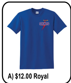
A) $12.00 Royal