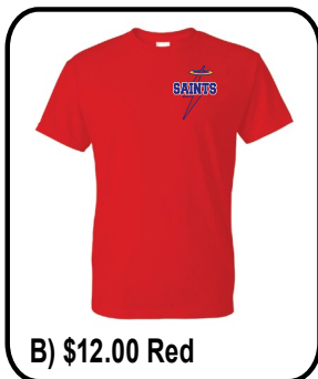
B) $12.00 Red