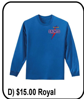
D) $15.00 Royal