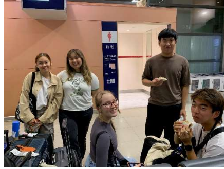
Kalani Delegation waiting for their hosts at Osaka Airport

Ritsumeikan High School has hosted the annual Japan Super Science Fair (JSSF) since 2002. High school students who love science from all over the world will join together in the hopes that they can build a wonderful network and create a bright future together through this opportunity. Kalani is once again participating in the Japan Super Science Fair in Kyoto