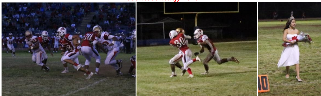
Kalani 27 - Roosevelt 12