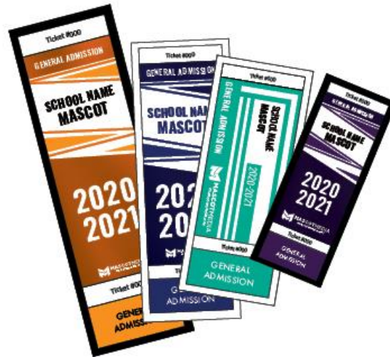
Stack (1.85" x 6") • Roll (1.75" x 5") • Fan Fold (1.75" x 4.25") • Minion (1.25 x 3.5")